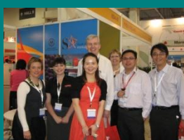
Delegation members at the SA stand at Food Hotel Asia expo