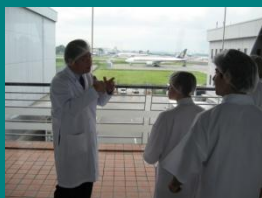
Delegation members at SATS